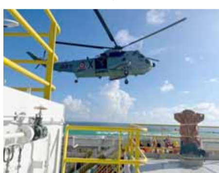
The exercise was conducted onboard Drill rigs Platinum Explorer and DDKG- of ONGC and RIL located about 40 nm south of Kakinada.

An offshore security exercise, 'Prasthan' was recently conducted in the Krishna Godavari Basin Offshore Development Area (ODA) under the aegis of Headquarters, Eastern Naval Command. Conducted every six